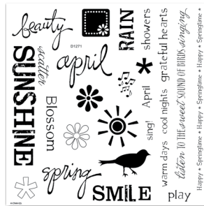
April Word Puzzle