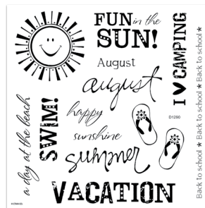
August Word Puzzle