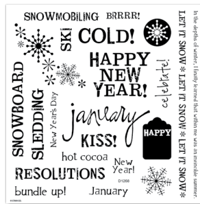
January Word Puzzle