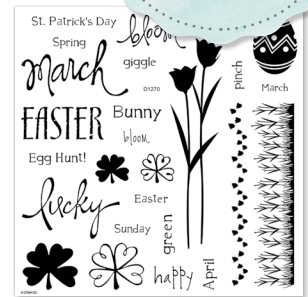
March Word Puzzle