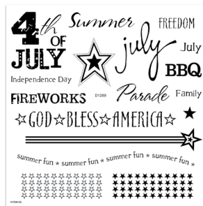
July Word Puzzle