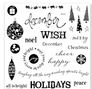
December Word Puzzle

Visit my online business address to learn more: