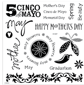
May Word Puzzle