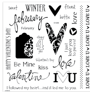
February Word Puzzle