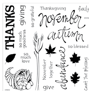
November Word Puzzle