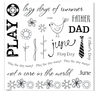
June Word Puzzle