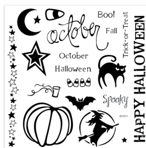
October Word Puzzle