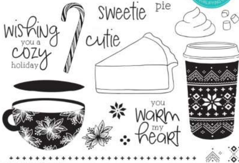
You Warm My Heart (19 stamps)

$18.95 S2011 Spend $50 and purchase for $5 recommended blocks: 1" x 1" (Y1000), 1" x 3/4" (Y1002), 2" x 2" (Y1003), 1" x 6/8" (Y1005), 2" x 3" (Y1006), 2" x 3/4" (Y1009)